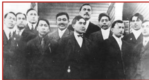
Photo courtesy of the Alaska State Library and the Alaska Native Organizations Photograph Collection. Alaska Native Brotherhood Founding Fathers.

The Alaska Native Brotherhood (ANB) is a nonprofit organization established in 1912. The first charter for ANB was formed by a group of 13 dedicated Native men known today as our Founding Fathers. The Alaska Native Brotherhood and Alaska Native Sisterhood have a long list of accomplishments including gaining recognition of Native rights as citizens and helping win the Native right to vote.