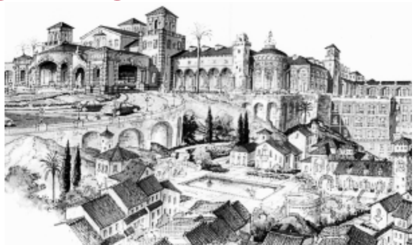
Conceptual drawing of San Pasqual Band's elegant casino resort facility near San Diego